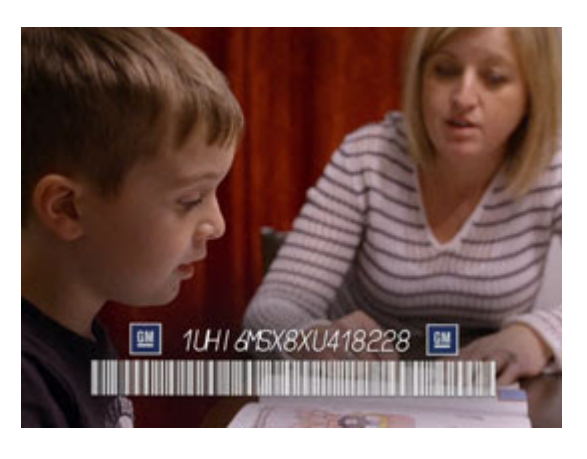
GM thinks it can rob Canada of jobs without repercussions, but more and more Canadians are on board to #BoycottMexicoGM.